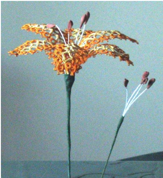
Completed flower - note the overlapping petals to produce a natural shape.